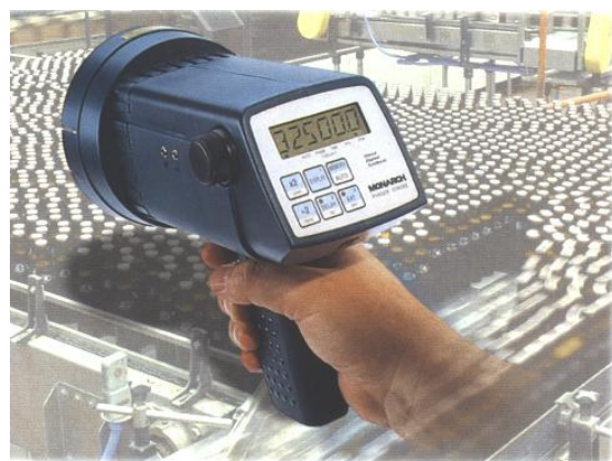
Phaser-Strobe PB 115