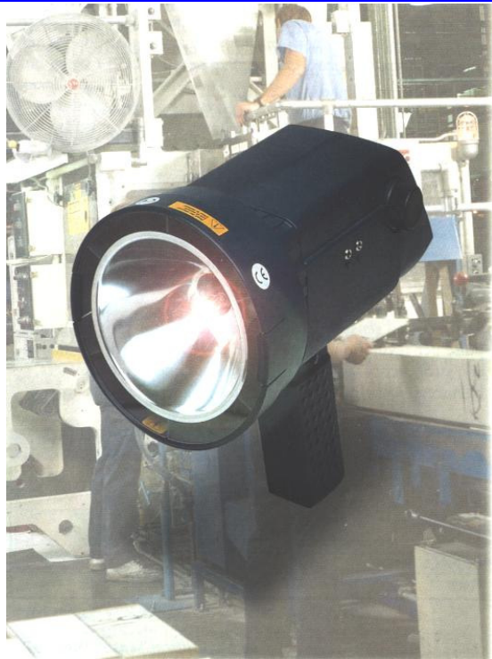
Nova-Strobe DB Plus